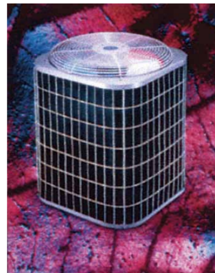
Application Shown: Residential heat pump

Small size, a variety of mounting options, and outstanding thermal response, makes the 3NT an excellent temperature control for dehumidifiers, freezers, heat pumps, ice makers, refrigerators, or any place where a fixed temperature control is required in a wet or dirty environment.